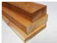
rough-sawn texture (rustic & beefy)